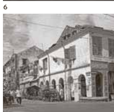
(1) Fullerton Building seen from Clifford Pier in 1957. (2) Marjorie Doggett in 1957. (3) Clifford Pier seen from the Asia Insurance Building in 1956. (4) Raffles' Statue and Fullerton Building in 1957. (5) Exhibition of Marjorie Doggett's photographs. (6) Intersection of Cross and Amoy Streets in 1955.