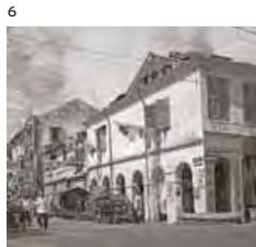
(1) Fullerton Building seen from Clifford Pier in 1957. (2) Marjorie Doggett in 1957. (3) Clifford Pier seen from the Asia Insurance Building in 1956. (4) Raffles' Statue and Fullerton Building in 1957. (5) Exhibition of Marjorie Doggett's photographs. (6) Intersection of Cross and Amoy Streets in 1955.